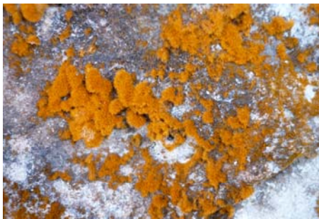
Terrestrial Alga: Trentopohlia aurea