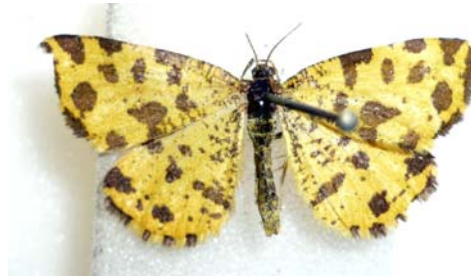
Speckled Yellow Moth