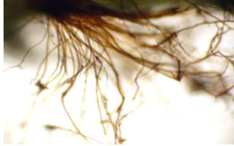
Ditrichum heteromallum - Rizoids