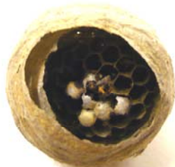
Norwegian Wasp Nest