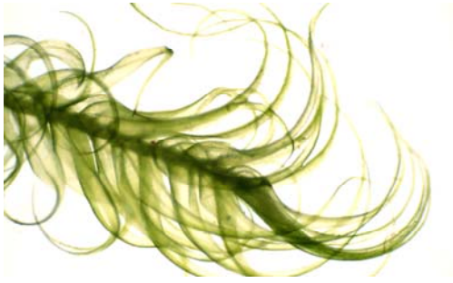
Moss Ditrichum heteromallum

From the March meeting, 2009, the following images show some of the items which were identified:-