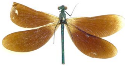
Damselfly – Agrion virgo